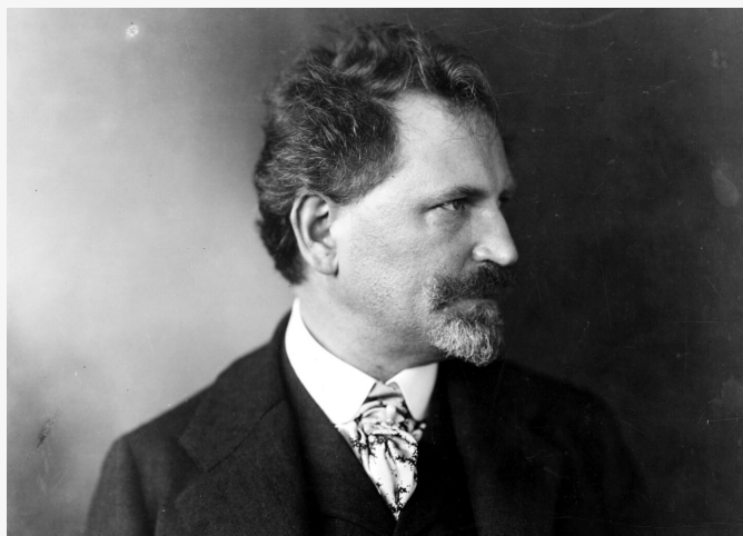
Alfons Mucha