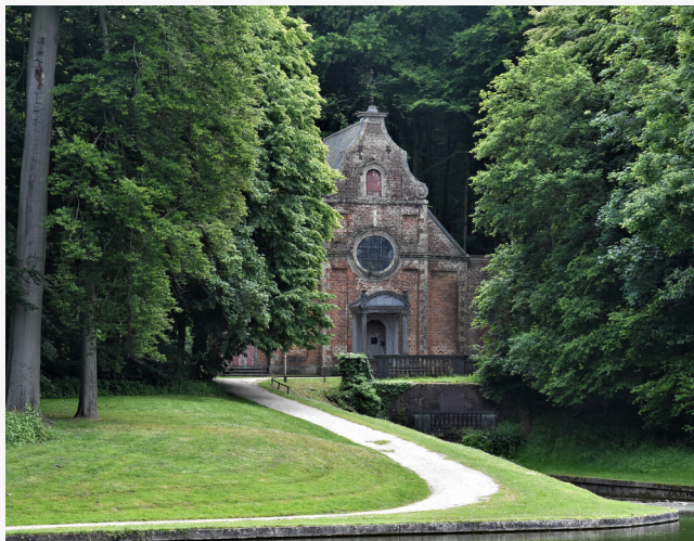
Gaasbeek Castle

Hello from Team Delphi. Since you last heard from us, our trainee co-creators have been adapting their co-creation projects to lock down realities. In parallel, the core team have finalised a competence framework, in line with the European Qualifications Framework, for Heritage Interpreters working in this setting.